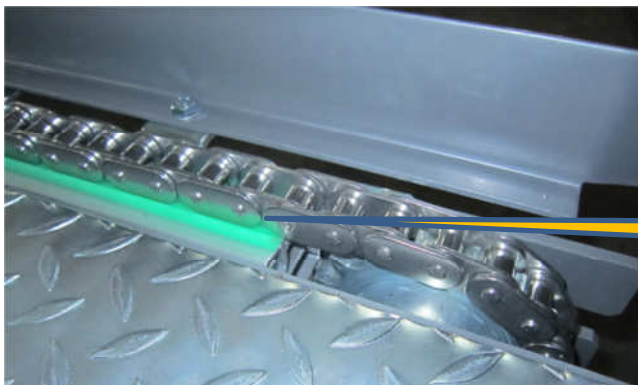
Top UHMW Guide Rail